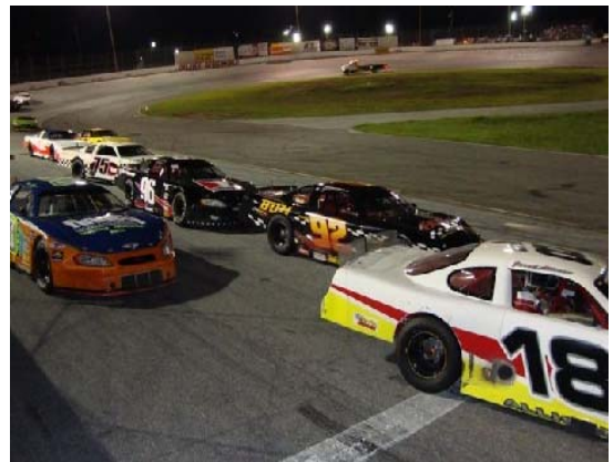
The No. 92 waits out one of the three red flags.