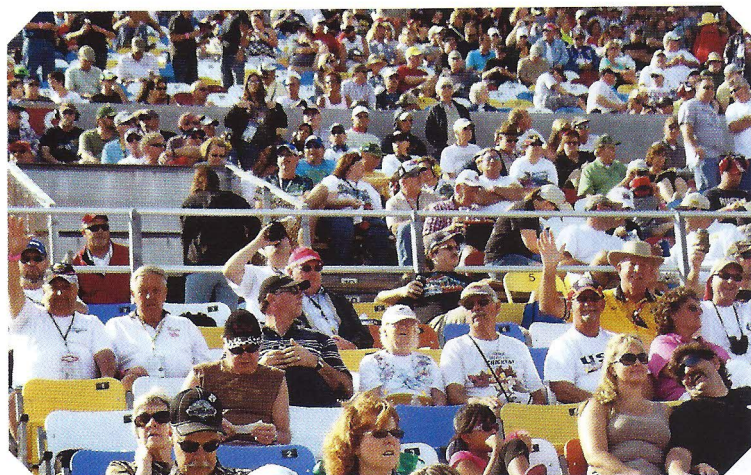
Some members of the Villages MRFC at the Budweiser Duel, Daytona Speedway.

Yes, we do bus trips to Daytona and carpool to different racetracks. The club also raises money for scholarships at places like Camp Boggy Creek. We have a lot of fun.