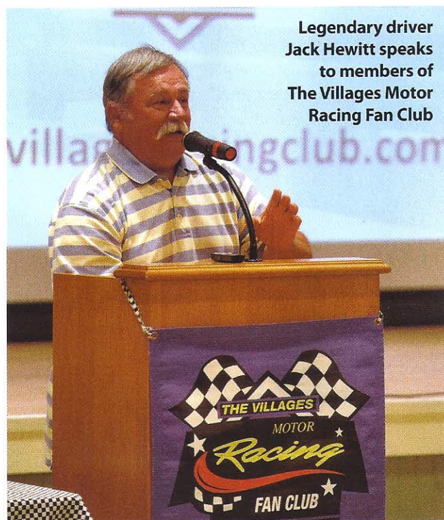
Legendary driver Jack Hewitt speaks to members of The Villages Motor Racing Fan Club

Living in England, Kennea followed Formula One because it was big in Europe.